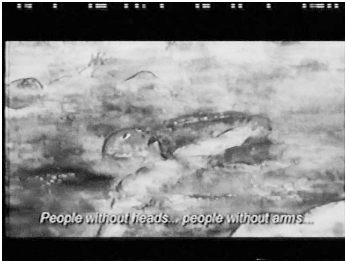
Figure 2. Tales of Japanese survivors as subtitled in Original Child Bomb

The final part of the film brings the effects of these atrocious events to the present, with comments and opinions expressed by several American students filmed in a classroom. As can be expected, the settings are made to change again, with no special