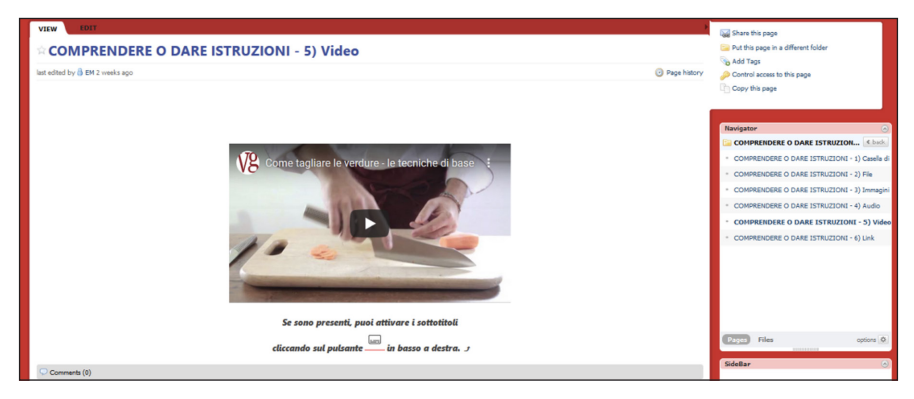
Figure 4. Videos

Multimedia teaching items are designed to meet basic training needs, supplementing traditional paper-based teaching aids. Moreover, a complete training course using only the application is imaginable as a stand-alone digital textbook. In this regard, students report a positive reception to the use of wikis for L2 learning and their participation in courses significantly increases (Sánchez-Gómez, Pinto-Llorente & García-Peñalvo, 2017).