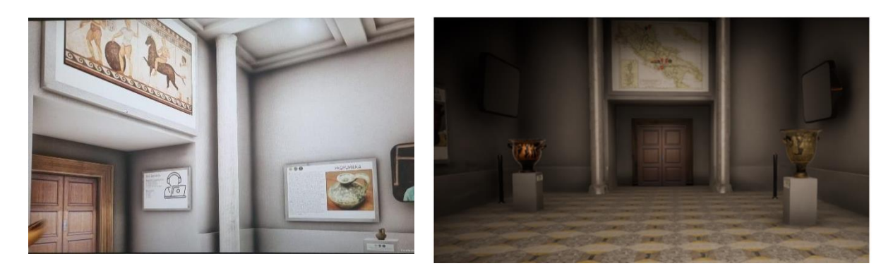
Figure 1 - Inclusive virtual museum created with Unity software

In museums, textual apparatuses do not play a privileged role but can help visitors understand the works. Therefore, in order to make the virtual museum accessible to everyone, including dyslexic children, the descriptions of the works have been reported using three different fonts, namely Arial , Times New Roman and OpenDyslexic (Figure 2). In this way, you can choose the font you prefer according to the individual needs of the users. To improve the accuracy and speed of reading in dyslexic subjects, it is possible to intervene on some parameters, such as the shape, spacing and size of the letters, using fonts that facilitate the decoding process (Reid, 2004; Di Tore, 2016). Taking