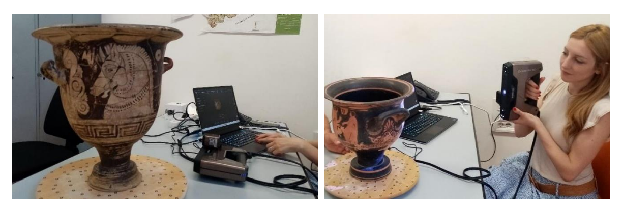
Figure 4- Scanning of the red-figure crater and the bell crater

As far as the National Archaeological Museum of Sannio Caudino di Montesarchio is concerned, a Red Figure Crater was scanned (Figure 4). The crater is a large vase found in a necropolis of the Valla Caudina, in Greek culture it was used to mix wine with water to reduce the alcohol content and was served at banquets, especially in the symposium. Another archaeological find scanned at the Montesarchio Museum is the so-called Bell Crater (Figure 4) considered a necessary tool until Roman times. The vase originates in the "red figure period" towards the end of the 4th century B.C. and confirms how in these lands great importance was attached to Hellenic myths and divinities.