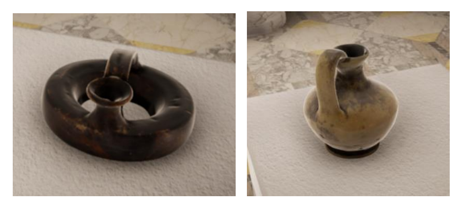
Figure 3 – Digital asset of the Guttus and the Perfumer

while the Archaeological Museum of Carife preserves a rare collection of Samnite finds. The 3D scans of the works were carried out using Shining 3D's EinScan Pro HD structured light 3D scanner. Specifically, a "Guttus" was scanned in the Archaeological Museum of Carife, the shape of which was used to embellish the container reserved for perfumed oils. The word Guttus means "vessel from which the liquid flowed drop by drop" and was used for multiple purposes, including as a women's toilet ritual. In particular, this Guttus (Figure 3) accompanied a Samnite fair on its journey to the afterlife for more than two millennia. Furthermore, a terracotta "perfumer" from the Samnite era was scanned in the Archaeological Museum of Carife. In the past, perfume was considered an expensive commodity, in fact this artifact was found inside the tomb of a high-ranking person.