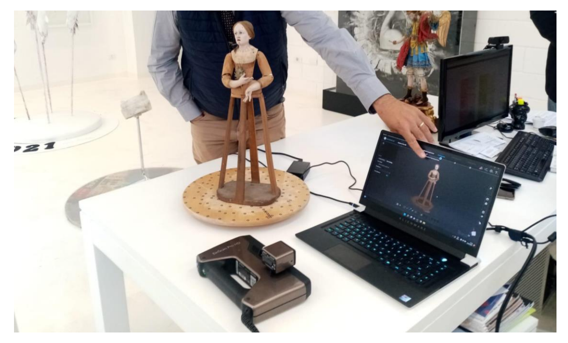
Figure 5- Scanning of the works at the De Chiara De Maio foundation

The scans of the works carried out at these museums are open-source, so it is possible to 3D print digital assets or add them within a three-dimensional navigation space, such as Serious games or Edugame. In addition, other works have been scanned at the De Chiara De Maio foundation, currently they are in the cleaning phase, which will be added to the site ScanItaly (Figure 5). Specifically, on the website of the Lab-H of the University of Salerno it is possible to know the evolution of the project and download the virtual museum file. The project file allows anyone, equipped with a virtual reality helmet, to immerse themselves in this virtual environment or, for those who do not have this technology, to move around the room using the keyboard of their computer.