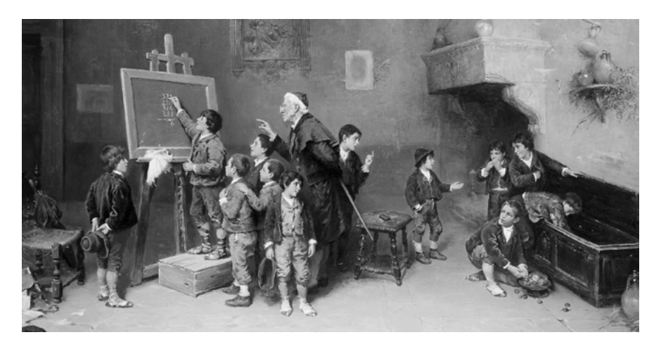
Fig. 10.1: Francesco Bergamini, Una lezione importante , oil on canvas, n.d., 50.5 x 81 cm. [Private collection].