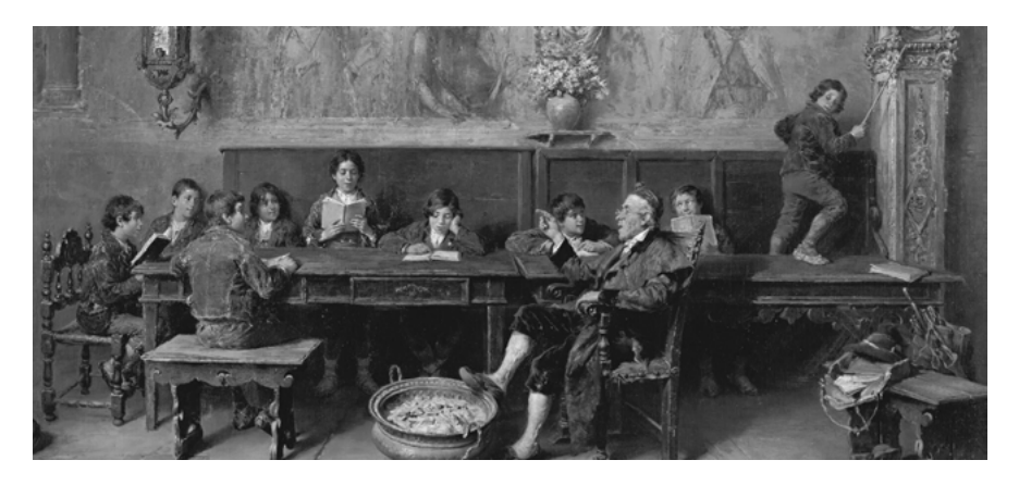
Fig. 10.2: Francesco Bergamini, L'alunno disubbidiente , oil on canvas, n.d., 55.3 x 90 cm. [Private collection].

education, which they saw as usurping their educational prerogatives.<sup>31</sup> By associating members of the clergy with a reactionary and conservative approach to education, and sympathetically representing the children's innocent, though irreverent, playacting, a