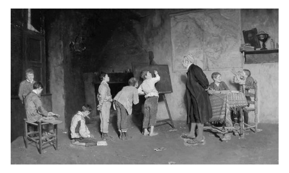
Fig. 10.4: Giuseppe Costantini, La scuola del villaggio , oil on canvas, 1888, 40.1 x 63.7 cm. [Calderdale Metropolitan Borough Council Museums and Arts, Halifax – United Kingdom].

stand at attention<sup>36</sup> and the punishment of the horse, that "consisted in striking with a whip one who is lifted up on the back of another".<sup>37</sup> Cicconi's ideological perspective on corporal punishments used in the schools of pre-Unification states recurred in his painting La scuola sotto i passati governi [School Under Past Governments], in which the walls of an almost empty classroom – themselves resembling "chewed bread" – were adorned with a handwritten notice that proclaimed: "Che buon pro facesse il verbo / Imbeccato a suon di nerbo / Nelle scuole pubbliche" [What good is the word / Prompted by the sound of the whip / In public schools].<sup>38</sup>