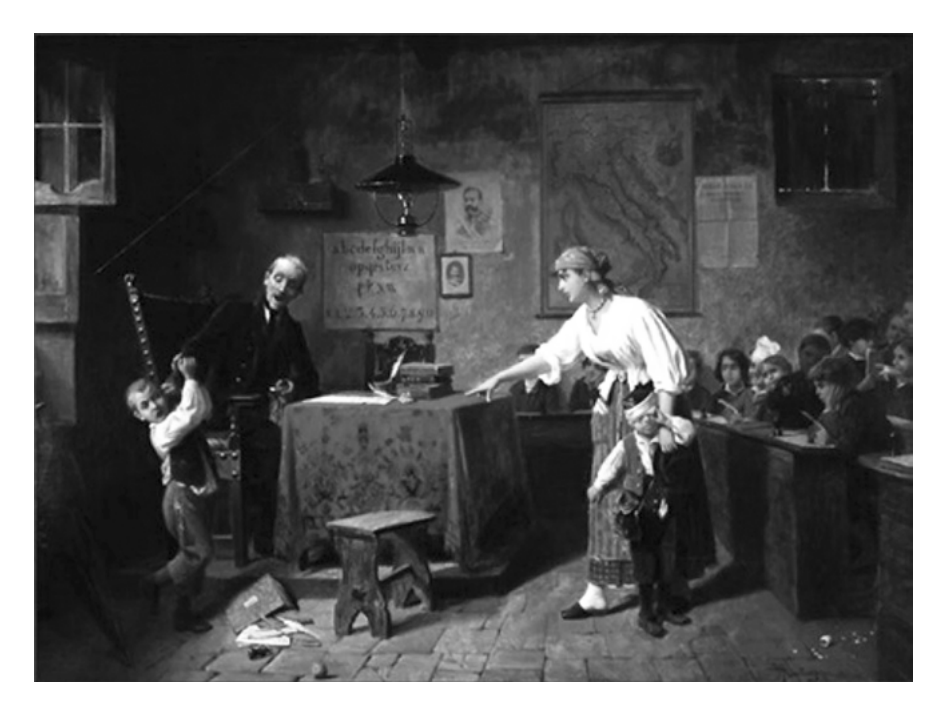
Fig. 10.5: Giacomo Mantegazza, La lezione allo scolaro o Chi la fa l'aspetta , oil on canvas, n.d., 76.2 x 105.4 cm. [Private collection].

urban schools appear to be perfect: a far cry from that we could name "impossible schools" that were often the only option available to children from rural families in the southern interior, where it would appear that "Italy" had not yet become a reality.