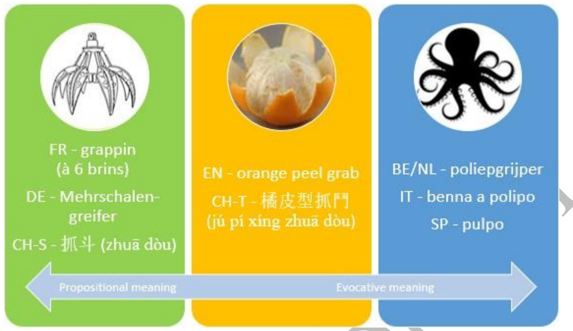
Figure 4 – Distribution of culturemes in 'orange peel grab' designations

In a hypothetical cross-linguistic distribution of culturemes, the 'orange peel' metaphor has revealed to be the least productive cultureme, in that it only shows in English, and partially in Taiwanese Mandarin (Traditional Chinese characters), where the semantic level has been neutralized, while it shows complete divergence with any other of the languages observed. Conversely, the 'octopus' metaphor seems to have succeeded as an accepted cultureme in both Spanish and Italian, but also in Flemish and Dutch, in spite of the cultural limitations imposed by its figurative content.