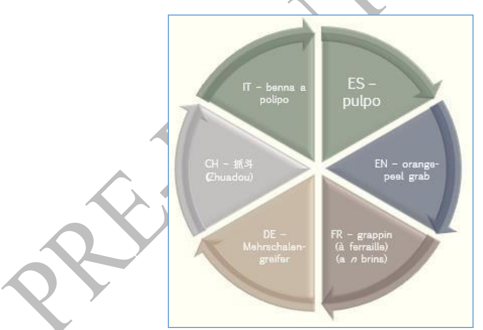
Figure 2 – Terms designating the device on the right in Figure 1 in multiple languages, drawn from the captions under the pictures of 'orange peel grabs' available on the web search pages in the relevant languages

The mechanical devices in Figure 1 represent the most common buckets used in industry (namely, a clamshell grab , on the left, and an orange peel grab , on the right). These devices are generally attached to a crane or excavator and used to lift objects (metal scraps, stones, wood chips, etc.). The terms in Figure 2, which designate the device on the right in Figure 1, focus on its shape – the device has six or eight segments (of 'peel') independently hinged around a central core. These terms are indicative of how a language impacts the speakers' worldview.