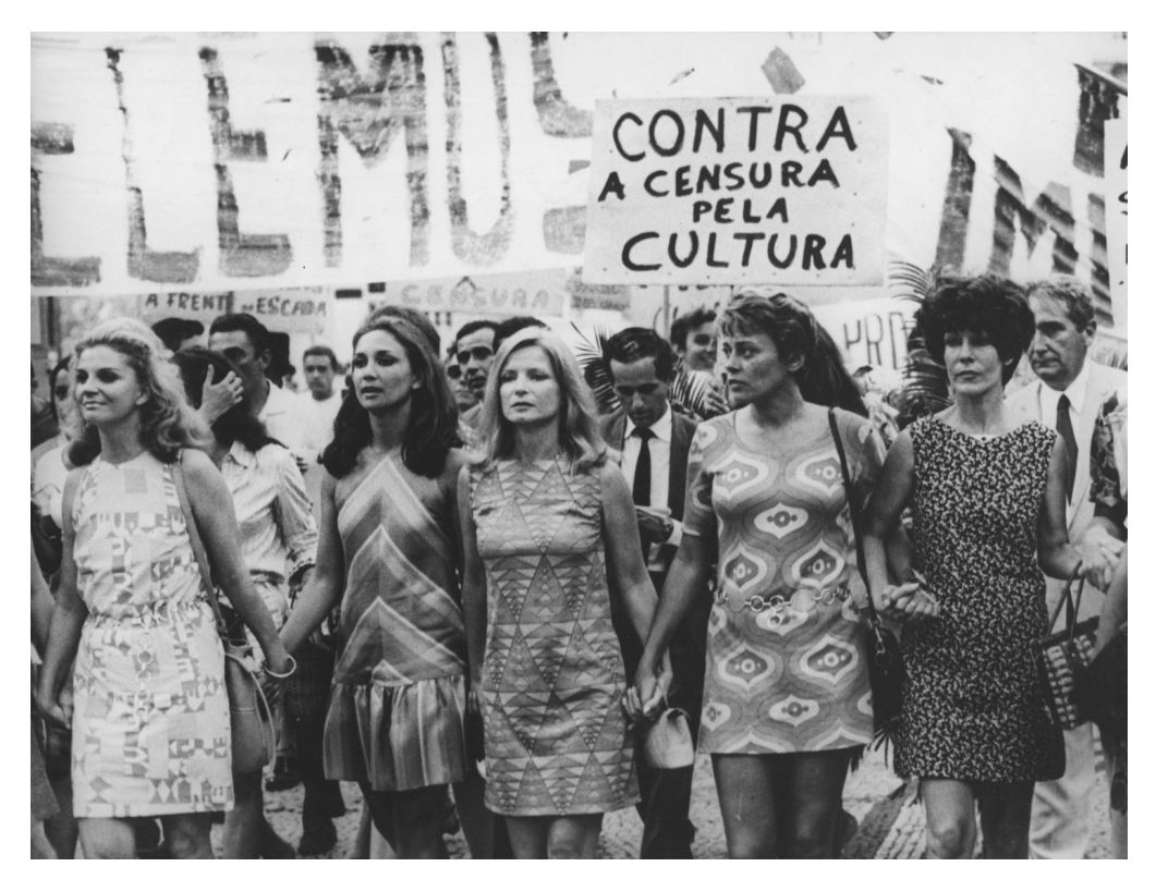
Artists protesting against the military dictatorship, February 1968

constituent power. In the United States after Independence just as in Revolutionary France, two entities that had already been previously foreseen are convened and began to function. Throughout the process, political transformations took place and these same political bodies declared themselves constituent assemblies. The Philadelphia Convention was convened, as we know, to amend the Articles of Confederation, a constitutional document that had been in force in the United States since 1777. In France, the General States were called by the monarch in a context of political and economic crisis, without, initially any intention of drafting