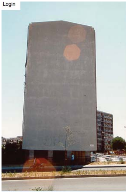
Fig. 9. The idea of the Museum of Image