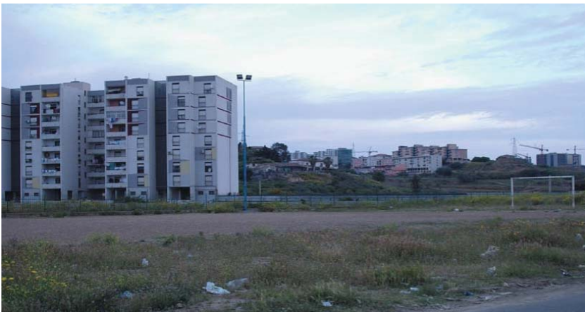
Fig. 5. Picture of the district