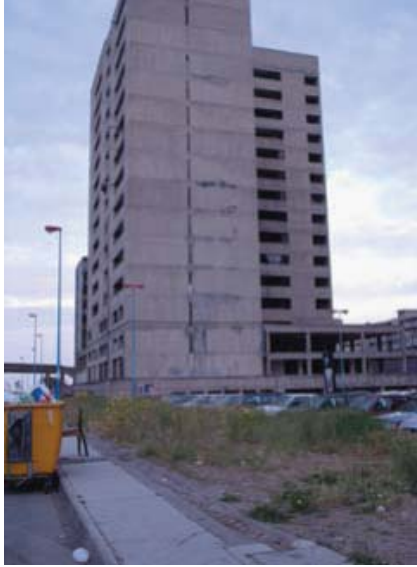
Fig. 6. Picture of the district, “il Palazzo di cemento”