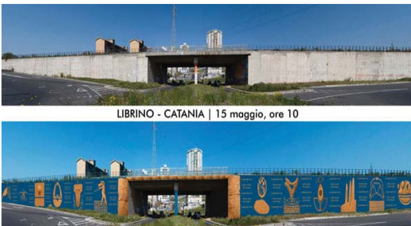
Fig. 8. From a bridge to a work of art