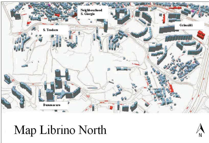
Fig. 2. Map Librino North