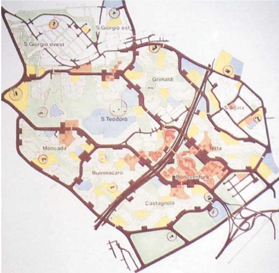
Fig. 3 Librino: Planimetry of Piccinato's Plan