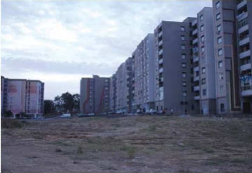
Fig. 4. Picture of the district