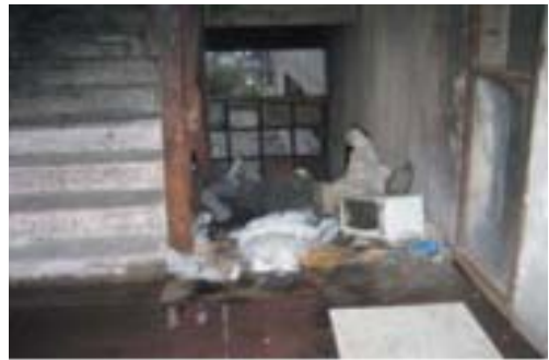
Fig. 7. Picture of the district, inside “il Palazzo di cemento”