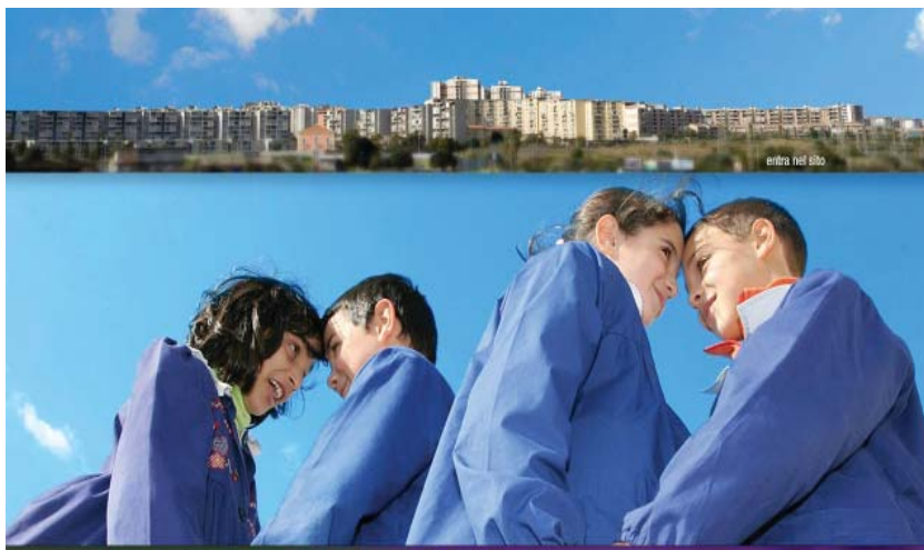
Fig. 11. The foundation's website with Librino children