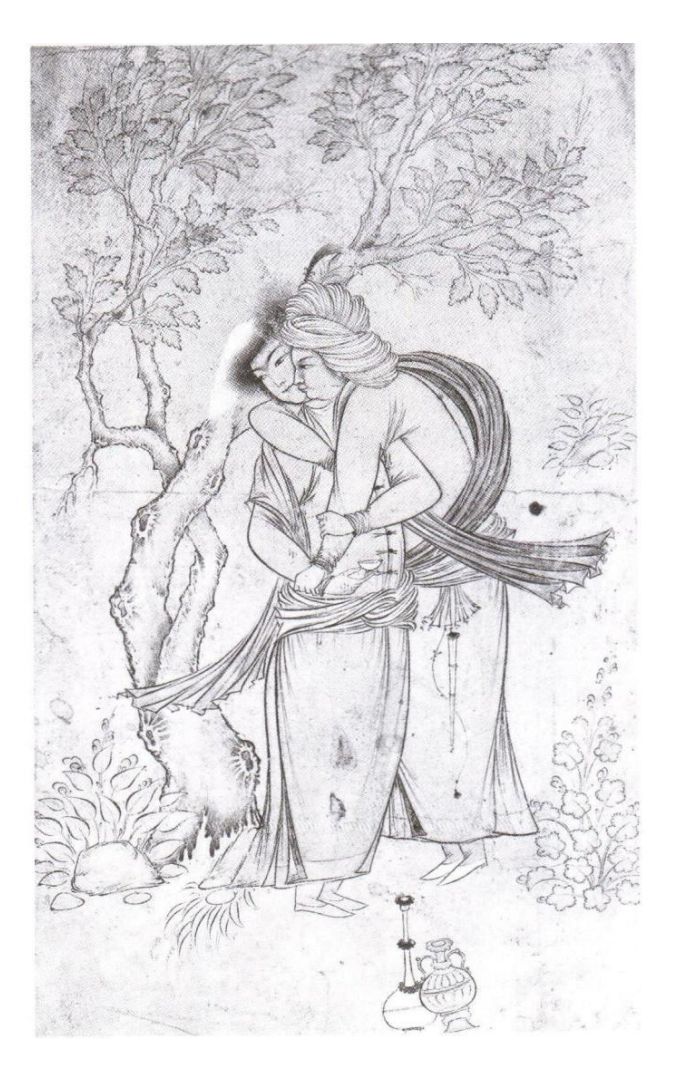
A Couple Embracing, 1600. Free Gallery of Art, Washington (Garabar 78).

In negārgari the artist avoids imitating God or in other words the painting does not set out to reflect reality. The artist tries to produce a generic representation or a prototype image of man, animal, and other creations. There is always the same form, figure, and face repeated to depict man, animals and elements of nature. Every image is a model, a prototype which attains symbolic significance. Images move away from reality and approach the world of dream and the unconscious (Scarcia Amoretti 2007, "Think, Say").