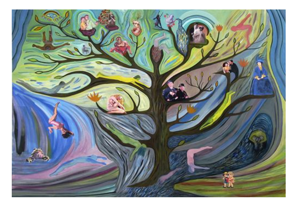
Diving into the Wreck, cover painting by Susan Bee.<sup>147</sup>

Bee gave the following explanation of her painting collection that includes Diving into the Wreck :