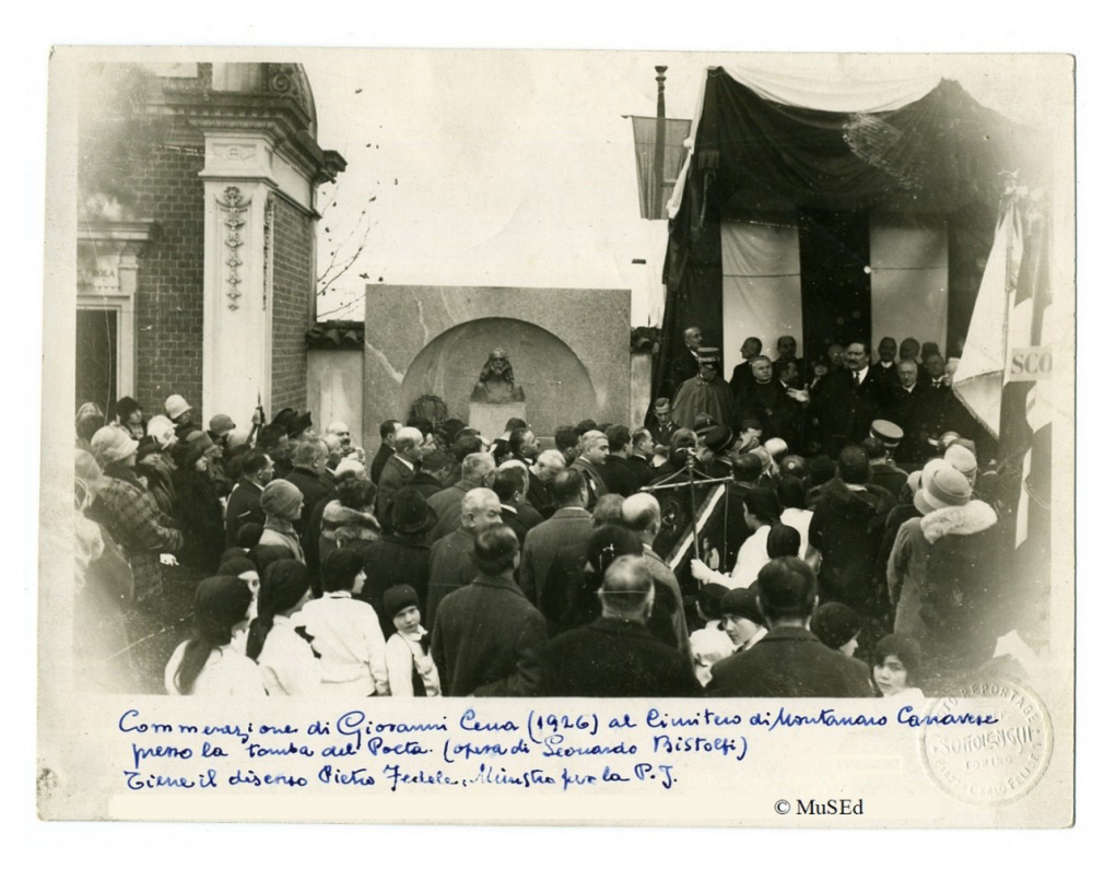
Fig. 1. The Minister of Public Education Pietro Fedele delivers his speech during the inauguration of the funeral monument to Giovanni Cena in Montanaro (1927)<sup>29</sup>

of subversion of the established order<sup>30</sup>. The Minister illustrated the presumed «deep spiritual affinities» between the two men: