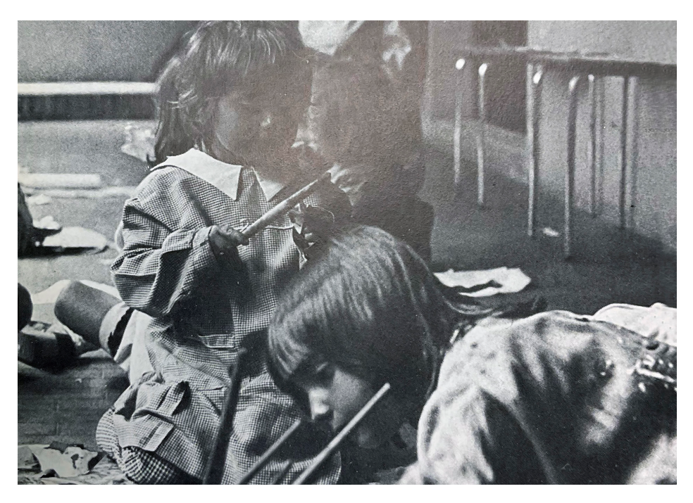
Fig. 3. Prima dell'ABC, «Biblioteca di Lavoro», V, 56, 1976, p. 7