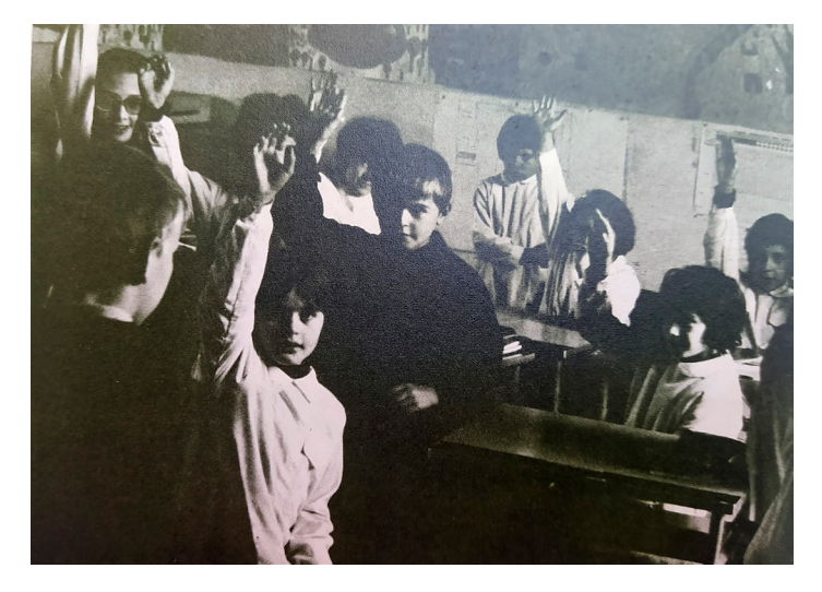
Fig. 2. L'unione fa la forza, «Biblioteca di Lavoro», I, 16, 1971, p. 13

collective class decisions. In L'unione fa la forza <sup>33</sup>, for example, the pupils are shown deciding together to set aside part of their school kitty to support striking workers.