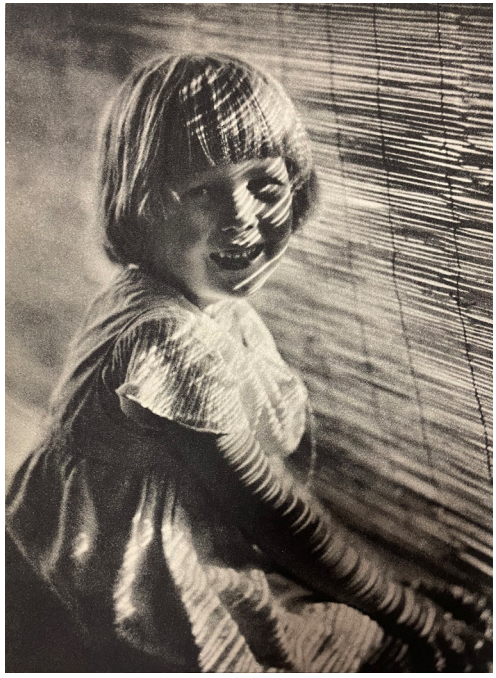
Fig. 3. Harold Cazneaux, Behind the bamboo shutter , table 8 published in Achille Bologna, How to photograph today , Milano, Hoepli, 1935, Photo Archive A.I.S.A., Florence

find a request for specialist manuals in exchange for a subscription suspended by the periodical «Corriere fotografico» of Milan and published by the same company<sup>28</sup>.