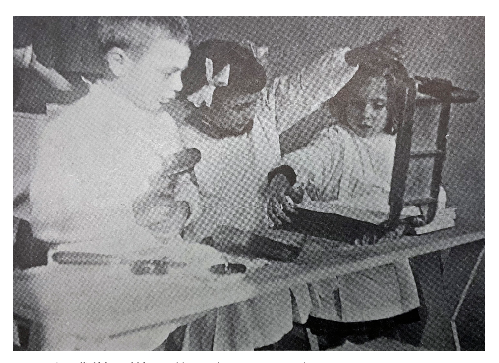
Fig. 4. Dall'alfabeto al libro, «Biblioteca di Lavoro», VIII, 94, 1979, cover image