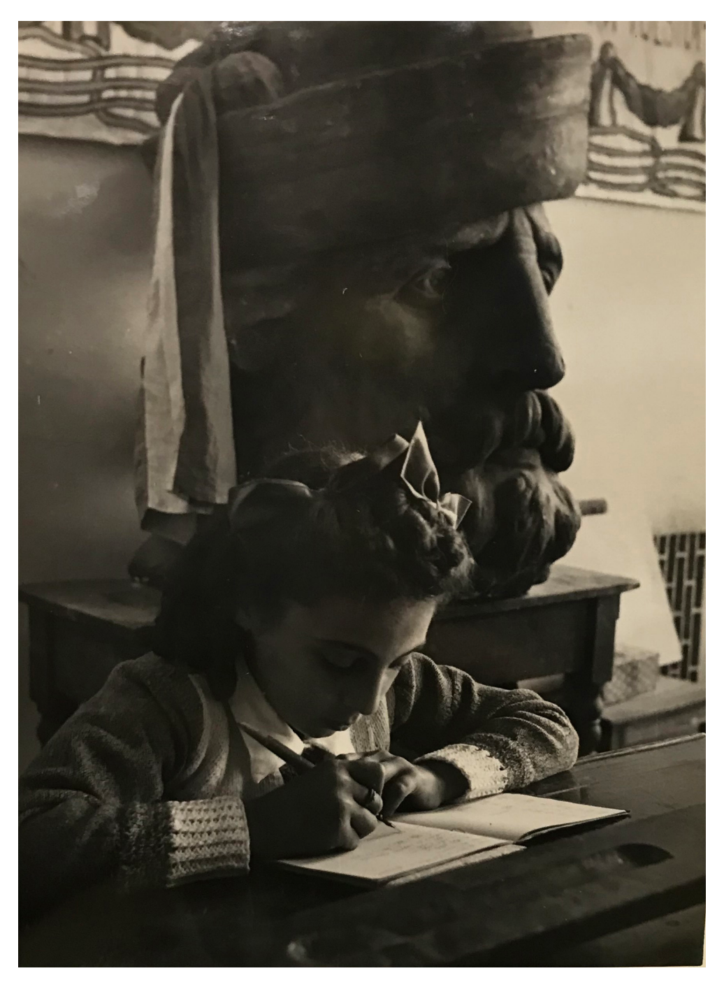
Fig. 5. School of Photography, ( Little girl writing ), 1945 ca., gelatin silver print, 24x18 cm, Album 18, Photo Archive A.I.S.A., Florence