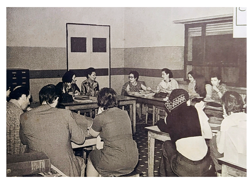
Fig. 1. Il tempo pieno: per affermare una scuola al servizio dei lavoratori, «Biblioteca di Lavoro», I, 18, 1973, cover image

It is also interesting to note that the focus of attention is never, as according to the collective imagery we might expect, namely the teacher's desk or the blackboard in a dominant position. The children are always looking at multiple points, concentrated on the various types of activities going on at the same time in the various classroom spaces. At the same time the focus of the camera lens is not one directional. It is virtually never focused on a single subject but rather takes in the dynamic nature of the school situation.