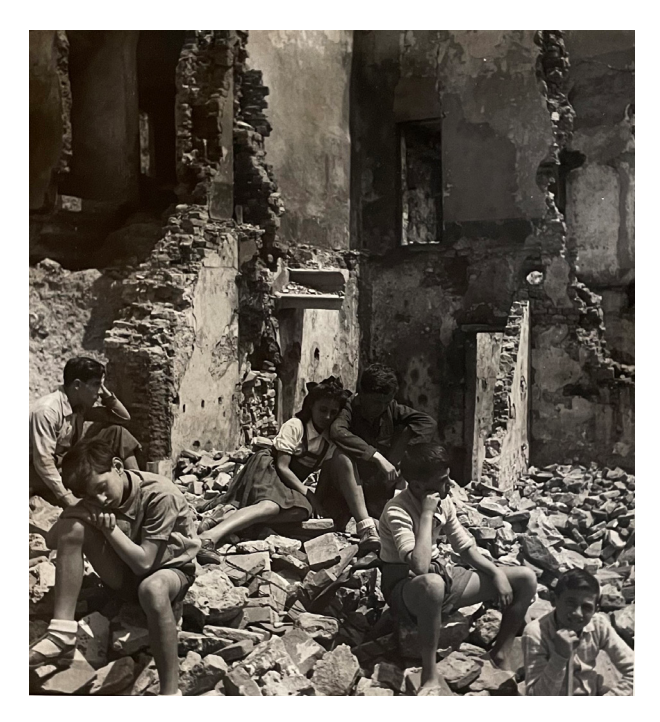
Fig. 4. School of Photography, (Students in rubble), 1945 ca., gelatin silver print, Album 18, Photo Archive A.I.S.A., Florence

These are just a few comparisons, somewhat instrumental, that help us to understand the visual imagery in which this photographic production of a scholastic and institutional nature appeared – a visual culture that certainly teachers but also pupils could observe in its dissemination in specialist magazines and exhibitions.