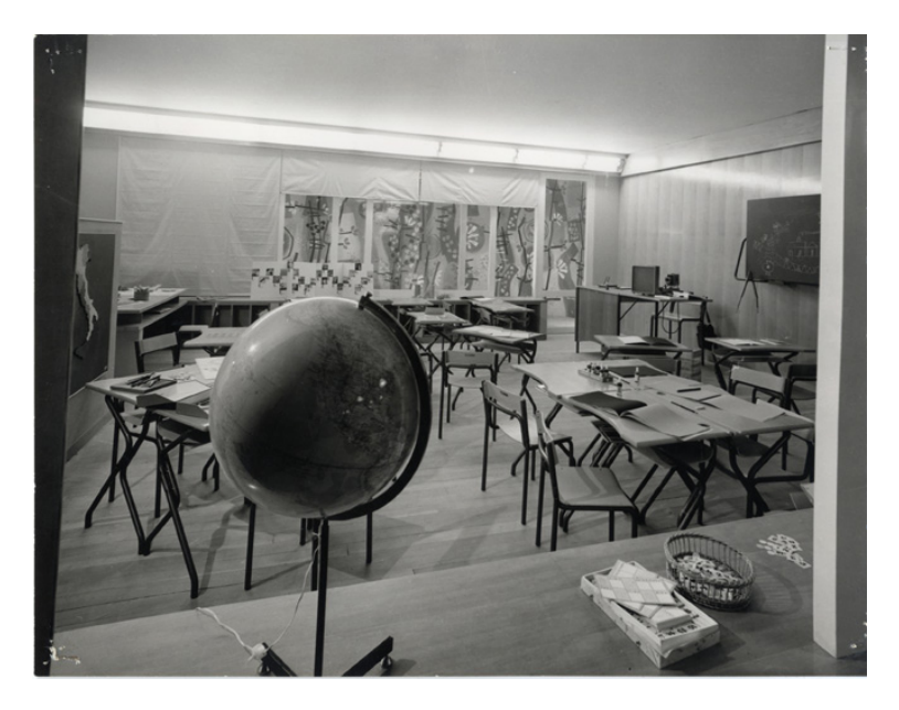
Fig. 1. Example of common classroom in elementary school with school desk and chair in curved steel and curved plywood by Achille Castiglioni, Pier Giacomo Castiglioni and Luigi Caccia Dominioni, 1960, produced by Palini firm, XII Triennale di Milano, Home and school section, TRN_XII_10_0554.