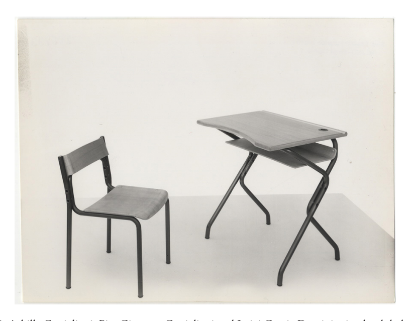
Fig. 2. Achille Castiglioni, Pier Giacomo Castiglioni and Luigi Caccia Dominioni, school desk and chair in curved steel and curved plywood, 1960, produced by Palini firm, XII Triennale di Milano, Home and school section, Installation and "production islands", TRN_XII_08_0429_01.