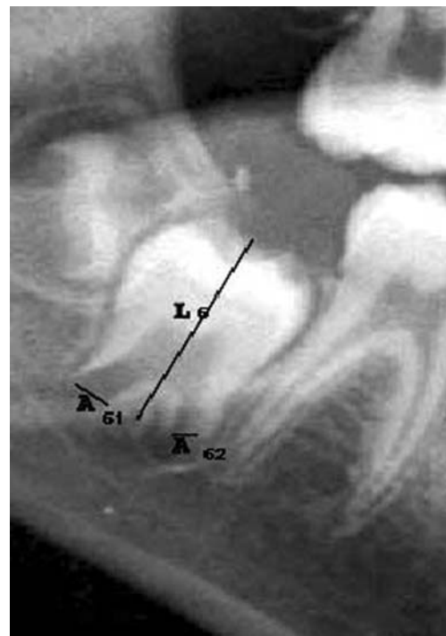
Fig. 2 An example of measurement of a tooth with two roots. A_6 is the sum of the distances ( A_6 = A_{61} + A_{62} ) between the inner sides of the two open apices, and L_6 is the length of the second molar