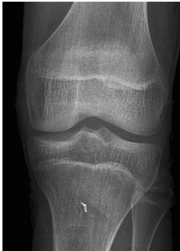
Fig. 2 Stage 2: epiphysis is fully ossified and epiphyseal scar is visible

The second function of ROC curves is to allow direct comparison of the abilities of different indicator variables to make correct classifications through a common metric, the AUC. Lastly, ROC curves facilitate the selection of a