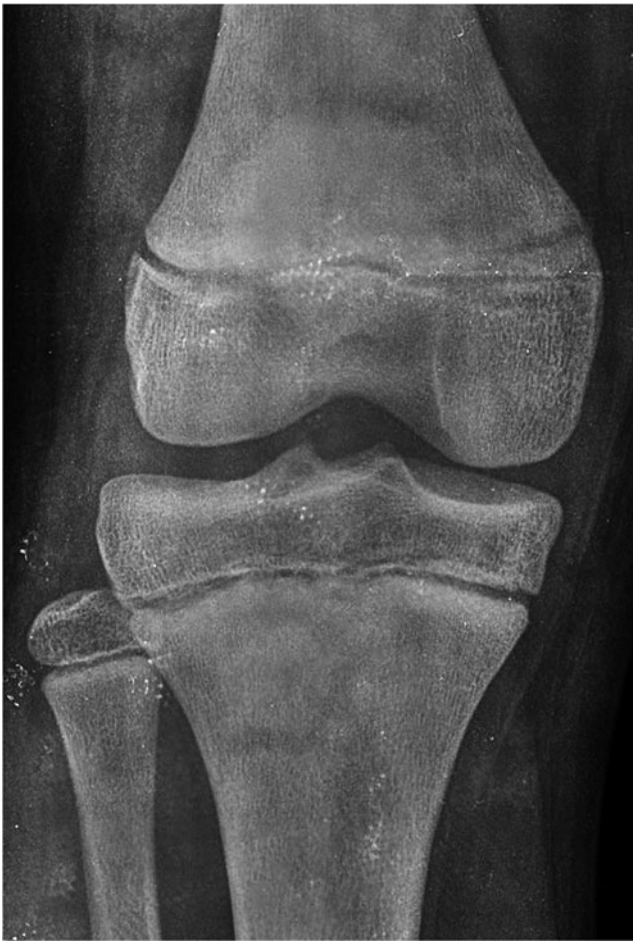
Fig. 3 Stage 3: epiphysis is fully ossified and epiphyseal scar is not visible

maximum threshold value of the indicator variable which best balances sensitivity and specificity. For each indicator variable, the curve shows the trade-off between sensitivity and specificity for any potential threshold [48, 49].