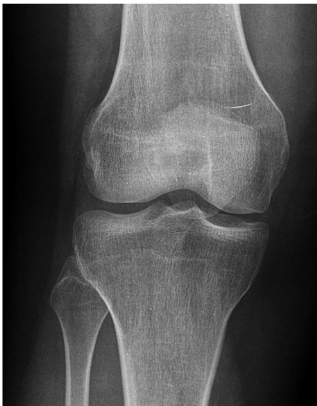
Fig. 1 Stage 1: epiphysis is not fused